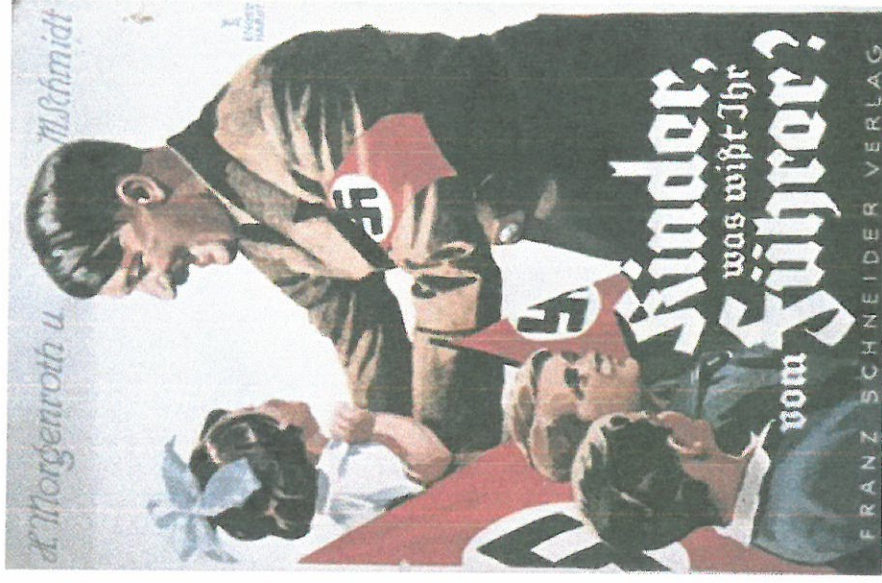
“Children, What Do You Know of the Führer?”