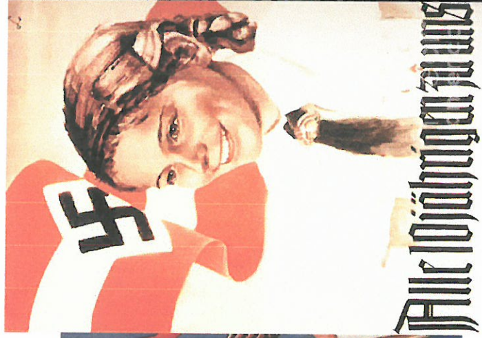
“Every Girl Belongs to Us”